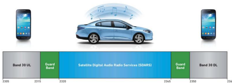
Figure 2. The satellite radio/LTE Band 30 coexistence challenge.

Satellite radio is another case where even standard BAW filters are not capable of meeting requirements, and temperature-compensated BAW filters are needed. The satellite digital radio audio service (SDARS) band is sandwiched between the uplink and downlink bands of FDD-LTE Band 30, which operates in the Wireless Communications Service (WCS) spectrum (Figure 2). Only a 5 MHz guard band exists on each side of the SDARS spectrum. To enable satellite radio services to operate while protecting the adjacent WCS band from interference, a fully temperature-compensated BAW filter with near-zero TCF is needed. The filter is embedded in the vehicle's antenna.