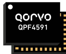
34 Pad 4 x 3 mm Laminate Package